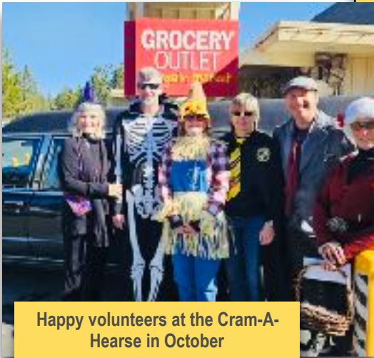
Happy volunteers at the Cram-A-Hearse in October