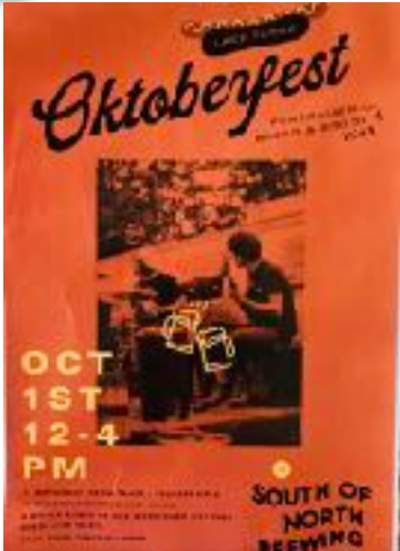
South of North Brewing Company Fundraiser Oktoberfest October 1