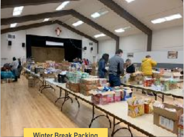
Winter Break Packing

Thanks to the many B&B 4 Kids volunteers who participated in these many activities and fundraising events. You provided many happy smiles on the faces of the children of South Lake Tahoe.