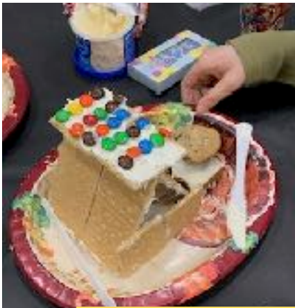
Making Gingerbread Houses with Students at Mt. Tallac High School